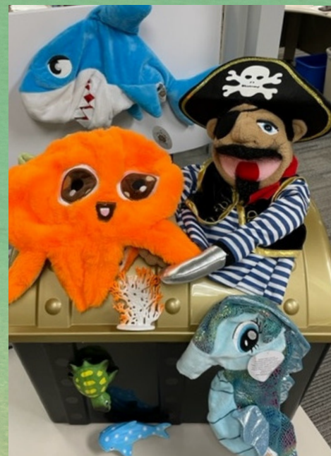
Discover Oceans of Possibilities at the library this summer!

Enabling Our Community to Thrive by Offering Lifelong Opportunities to Connect, Learn, and Create