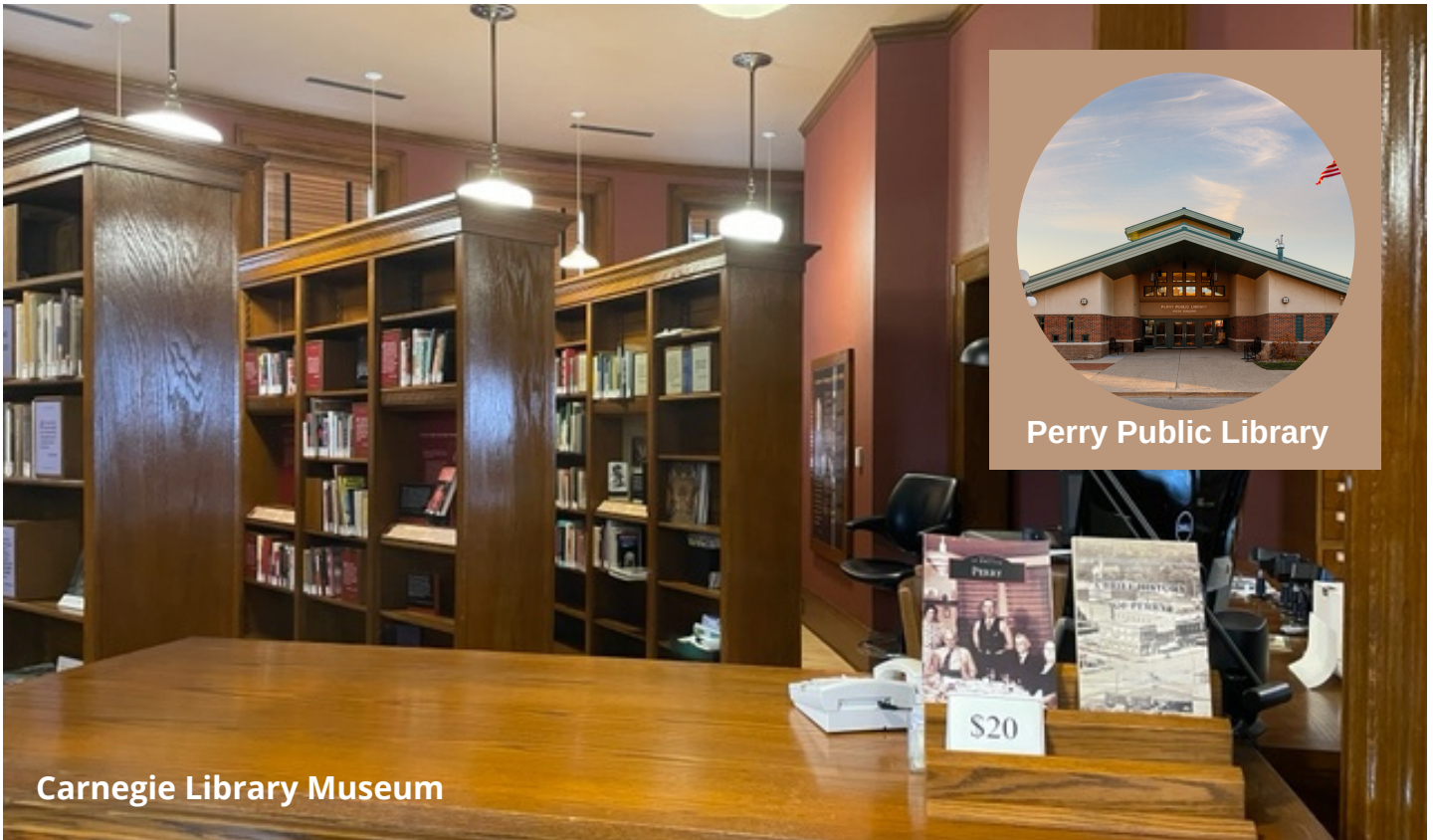
Carnegie Library Museum